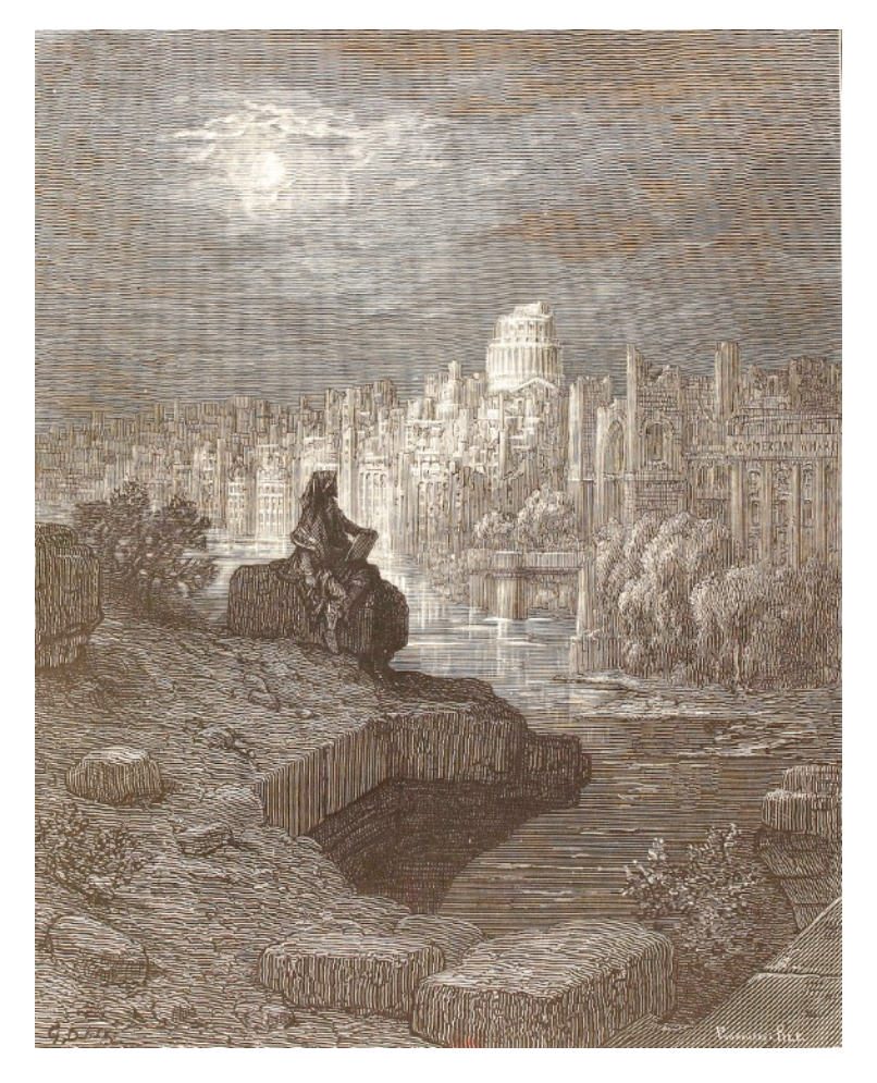
Gustave Doré, 'The New Zealander' from Gustave Doré and Blanchard Jerrold, 'London: A Pilgrimage', 1872

On Sriwhana Spong and the Contemporary Art Thesis