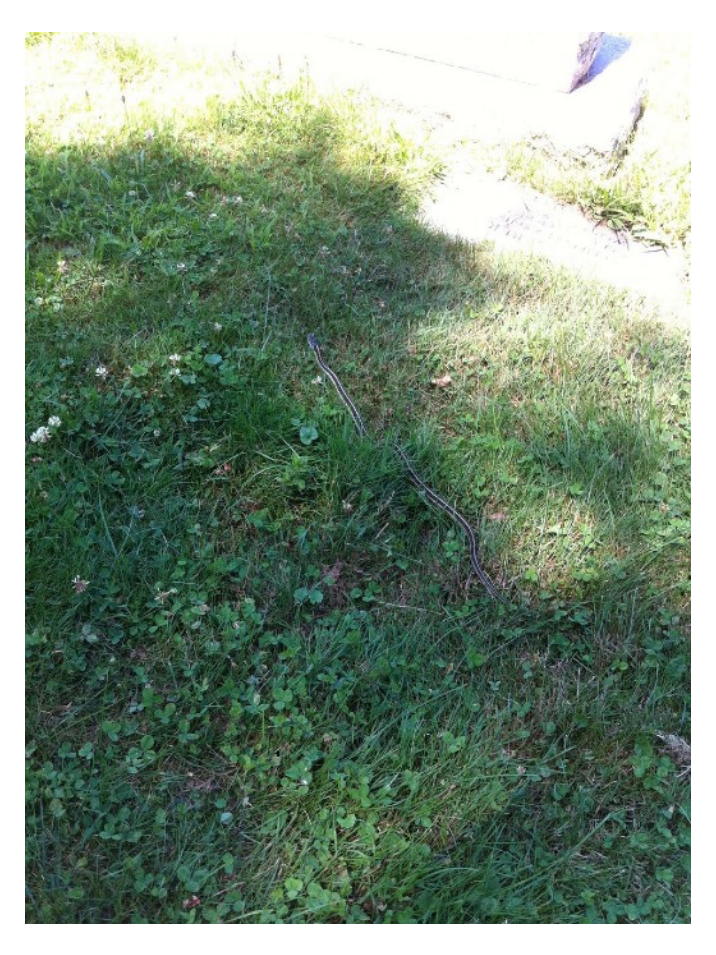
Sriwhana Spong, 'Figure 3. The Allegheny Cemetery, Pittsburgh, 12 July 2016, 1:48:10 pm' from 'Scirinz (a running sore): particular and ecstatic scripts of the body by mystic women in the Middle Ages and early Modern Europe', PhD diss. (University of Auckland, 2021).

THERE'S A TENDERNESS HERE, as Spong embraces these pre-modern women as figures of guidance. The writing is close, intimate, delving between the personal and theoretical as she forms pacts with each. Here, heroines are held in essay form, and Spong offers herself in submission to those she admires. Apprentice comes to mind. Not in the contemporary, vocational sense, but in the truer, medieval genesis of the word. If Spong is attentive and practices humility, the Master will offer a clear path of ascension.