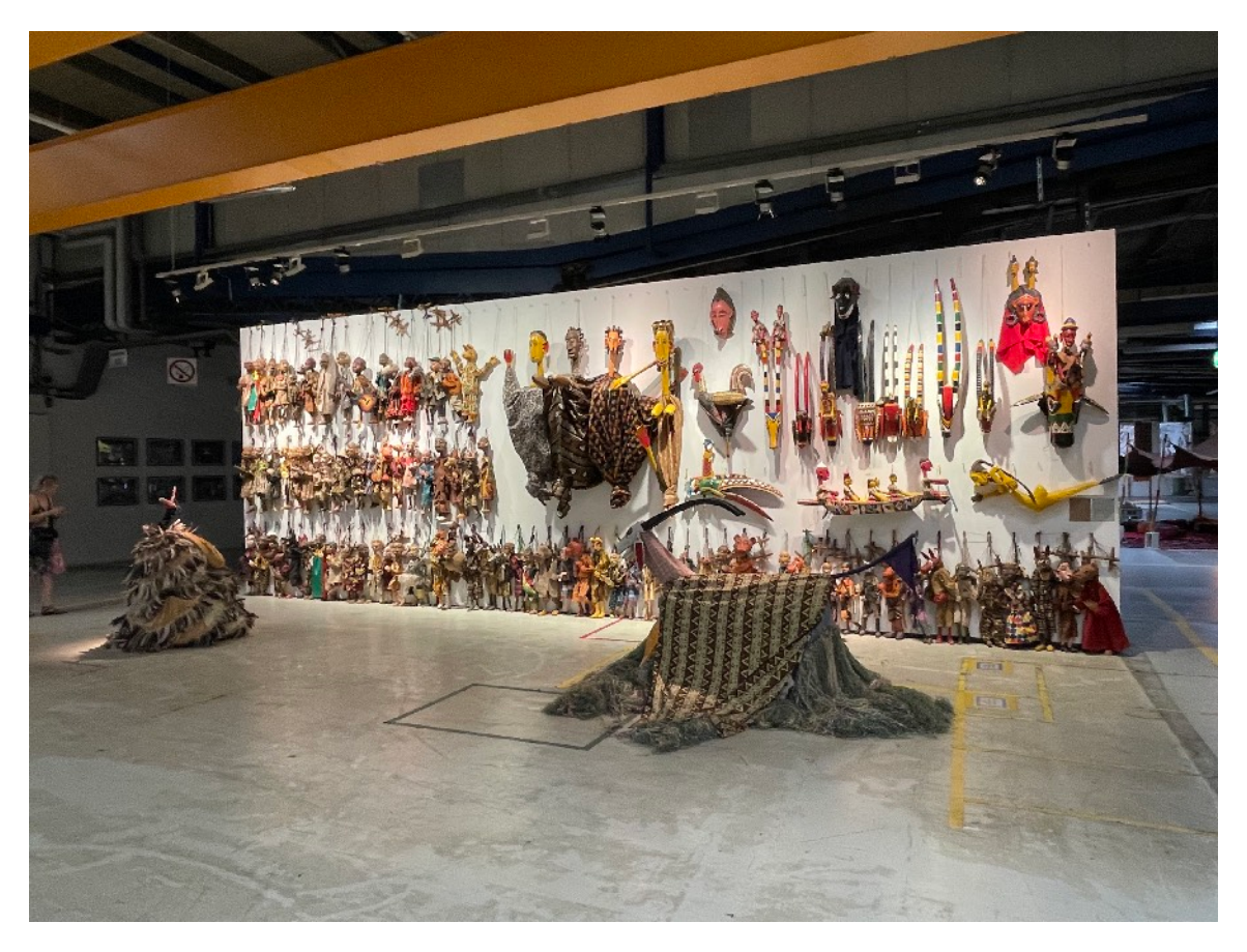
Fondation Festival sur le Niger, Yaya Coulibaly, 'The Wall of Puppets', 2022. Installation view, documenta fifteen, Kassel 2022

and histories, such as that of documenta and what Bude and Wieland in Die Ziet termed the 'hidden curriculum' of its founding.<sup>24</sup>