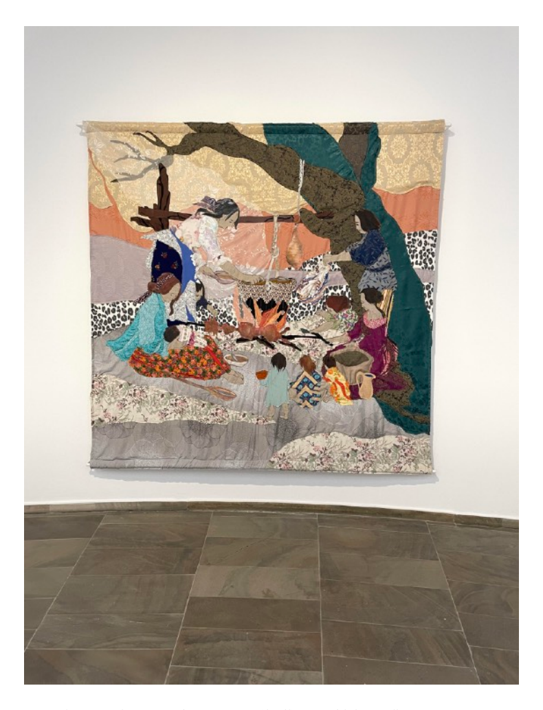
Małgorzata\ Mirga,\ 'Out\ of\ Egypt\ I-VI'\ (detail),\ 2021,\ fabric,\ acrylic,\ 2300\ x\ 3130mm

By and large, though, the event propagated an anti-curatorial aesthetic that was inspired less by institutional critique than by institutional takedown. Witness the crude slogans of foundationClass at KHB that were showcased in the Museum Fridericianum, such as 'Do you think the art academy is really for everyone?'. Given documenta's two-day ticket price of $75 this rhetorical statement read as disingenuous. Not least their statements lacked a sophisticated analysis of institutional predicaments and therefore their presentations within the frame of the academy courted contradiction.