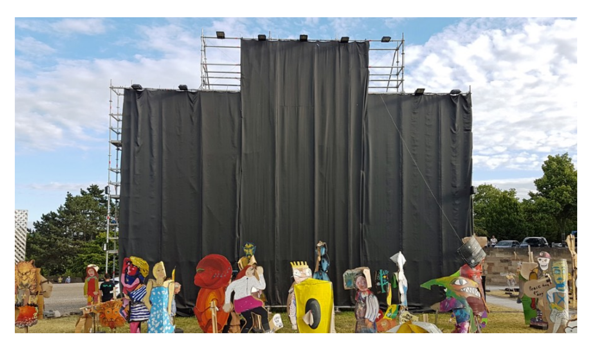
Black cloth obscuring Taring Padi, 'People's Justice', 2003. Installation view, documenta fifteen, Kasel 2022

On documenta fifteen and the twelfth Berlin Biennale