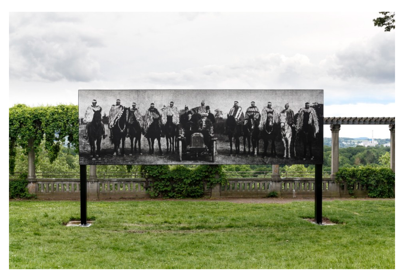
Nathan Pohio, 'Raise the anchor, unfurl the sails, set course to the centre of an ever setting sun!', 2015, ceramic ink on PVC, steel, LED, and concrete, commissioned by SCAPE Public Art, Christchurch, and coproduced by Creative New Zealand (Arts Council of New Zealand Toi Aotearoa). Installation view, documenta fourteen, Weinberg-Terrassen, Kassel 2017.

Recent events such as documenta fifteen and the 12th Berlin Biennale suggest that public facing platforms, such as art museums and large-scale exhibitions, are at a critical juncture